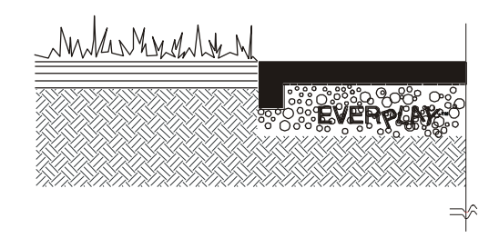
GRASS EDGE TREATMENT